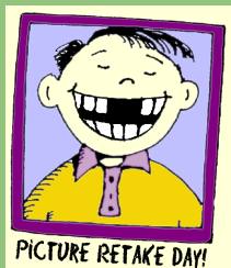
Photo retakes will be held on November 7th. Please email your child's teacher before this date to inform them if your child is getting a re-take.